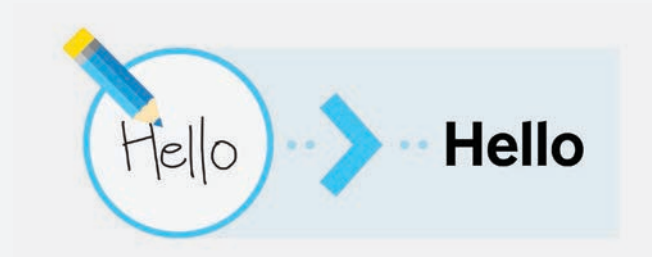
Figure 5. Handwriting Recognition

File Manager. Have complete control over your files through a highly usable interface just like what you'd be used to when using your PC. Easily create, save, and export your meeting history through the history browser or remain organised by making use of the contents browser to manage your images, audio, and videos.