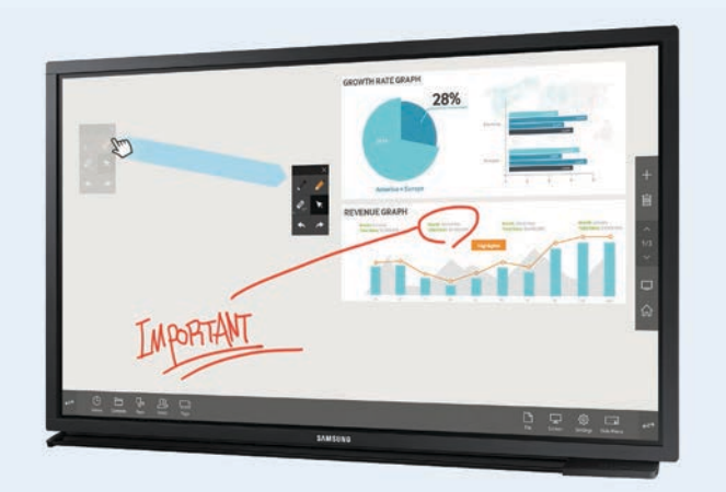
Figure 4. Feature for Easy Floating Menu and Draw on any Source