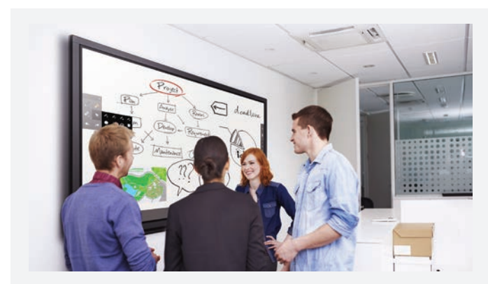
Figure 1. Increase productivity with interactive meetings