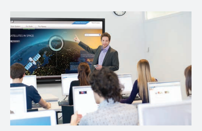
Figure 2. New lines of communication in the classroom

Gone are the days of educators needing to factor in the logistics of a typical projector system and the pitfalls and distractions that they come with. Samsung e-Board converts these past shortcomings into strengths through effective utilisation of FHD displays and interactive whiteboards. New lines of communication between teachers and students can now be forged, through data and file-sharing capabilities between the e-Board and devices of students, thus further creating an interactive presentation environment that holds attention spans and creates opportunity to diversify learning approaches. Samsung e-Board is well suited to help you convert your classroom into an intensive and engaging learning environment.