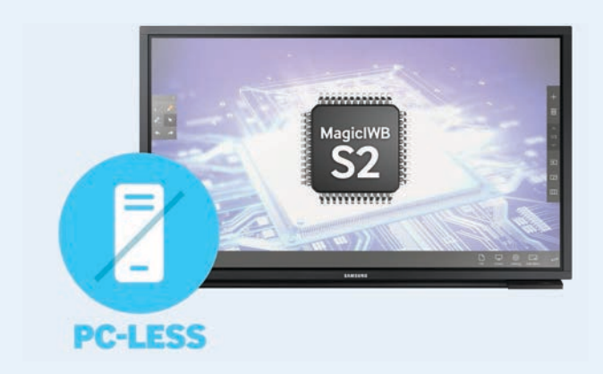
Figure 3. Embedded e-Board Solution that doesn't require a dedicated PC

No Dedicated PC required for e-board. Fully portable and flexible to minimise set-up time and allow for impromptu meetings through the use of enhanced expandability, enabling you to use laptops and tablets, simplified connectivity via multiple source inputs and effective utilisation of USB Auto Switching